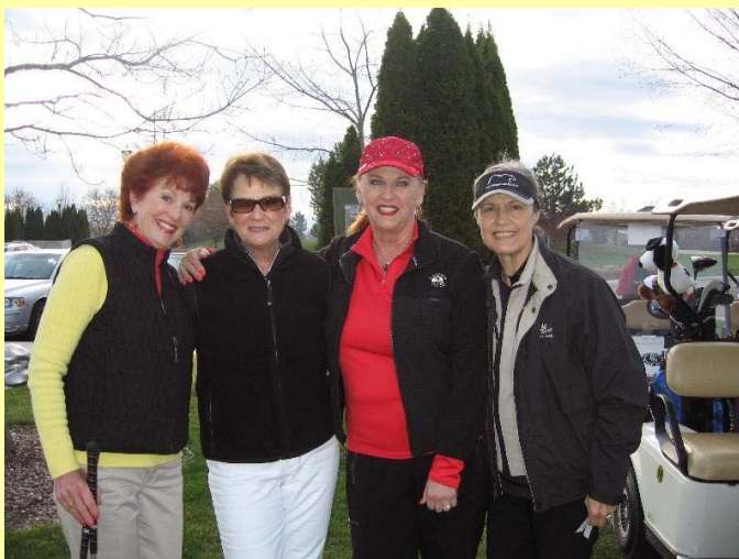
Second Place Team

The weather was just perfect - not too hot, not too cold, sunny and no rain even though it was predicted. It was a wonderful way to start off the season.